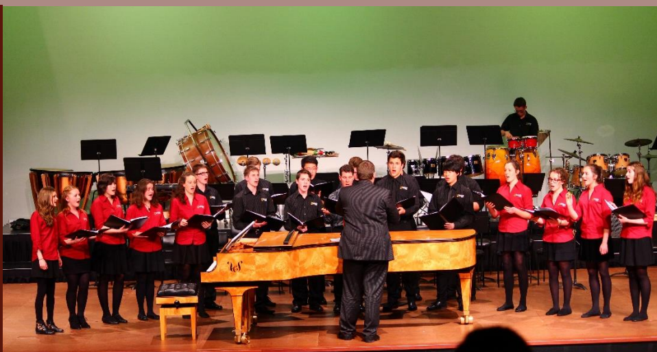
Chamber Choir Performing on the 2014 Australia Tour to Sydney & Brisbane