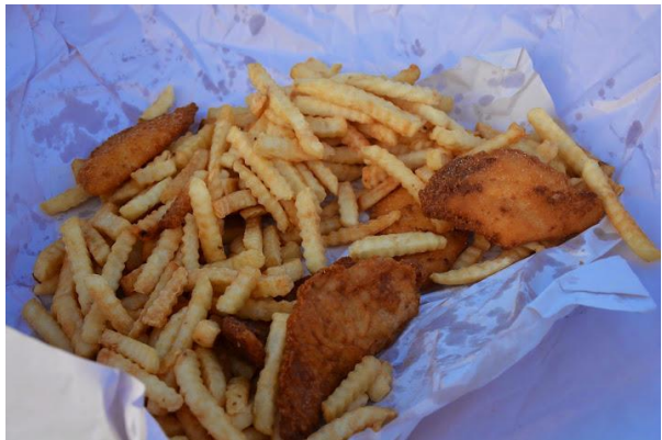
During a week end we went to Tekapo and I ate for the first time a Fish & Chips, so yummy!